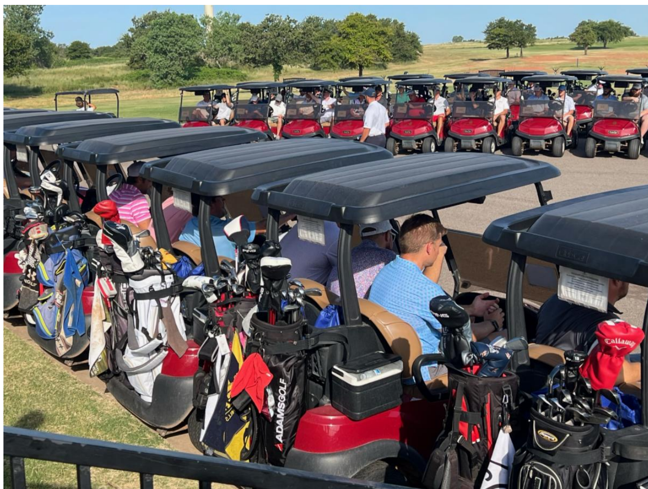
21st Annual Crout Classic Golf Tournament