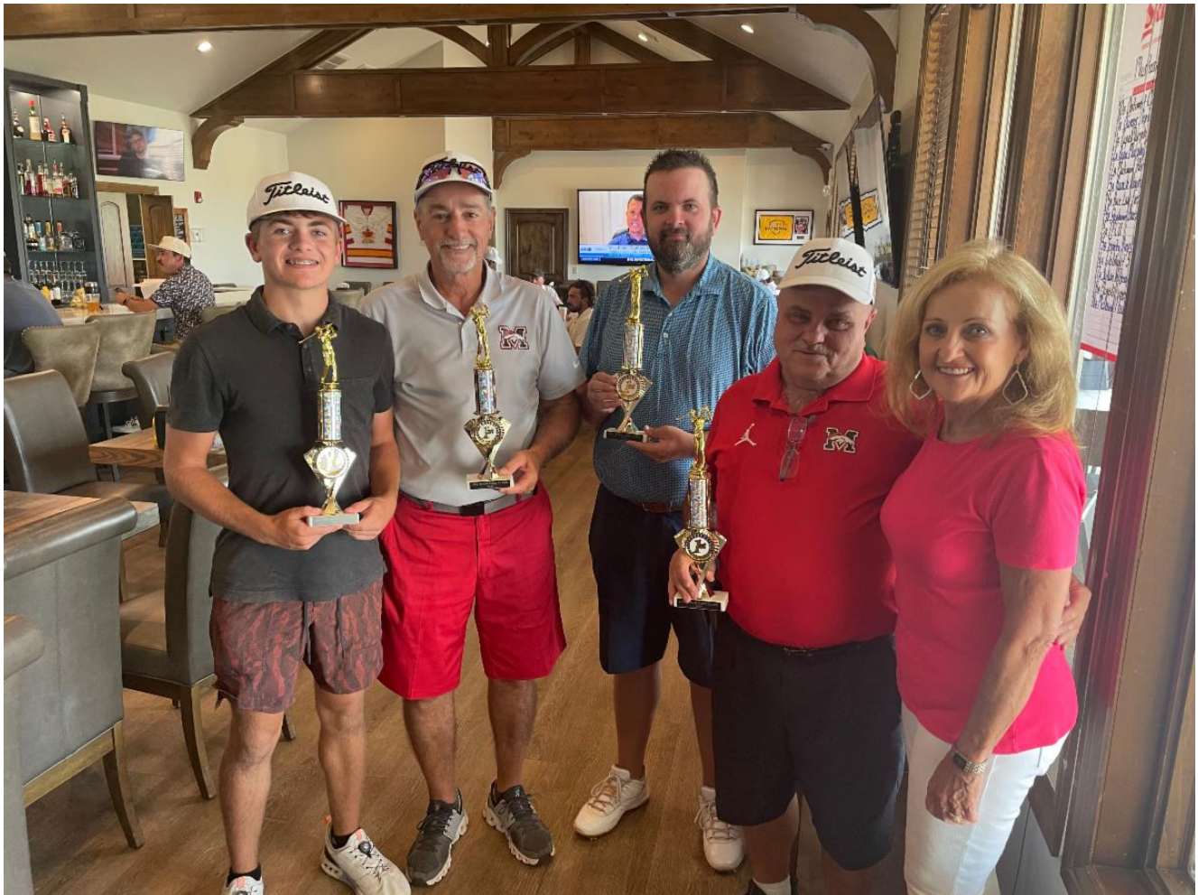
1st Place - Mustang Public Schools Athletic Department