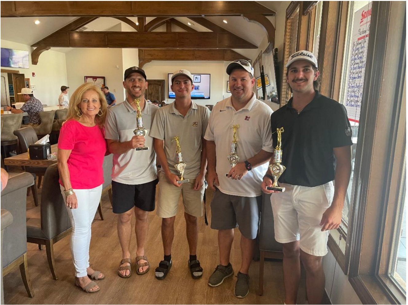
2nd Place - Green Family Chiropractic