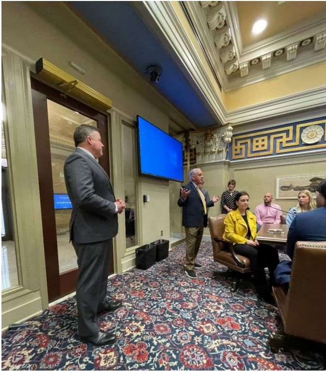
Legislators visiting with our PCLC Students