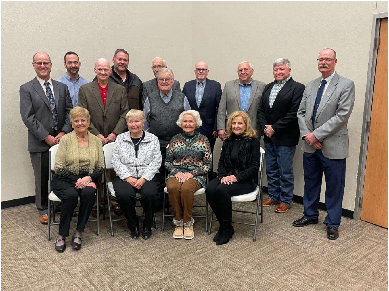
2023 Hall of Fame Banquet - Past Recipients