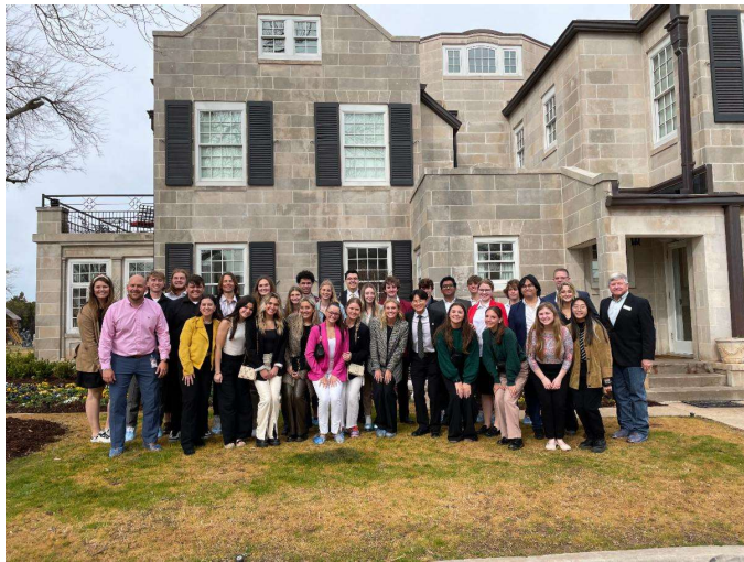
PCLC at the Governor's Mansion