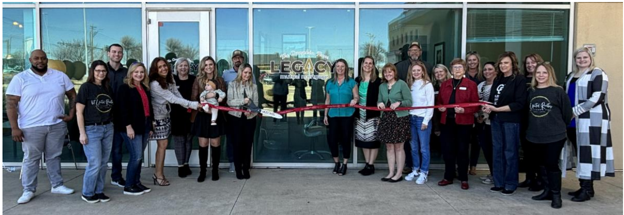
Legacy Mutual Mortgage - Dauphin Mortgage Team