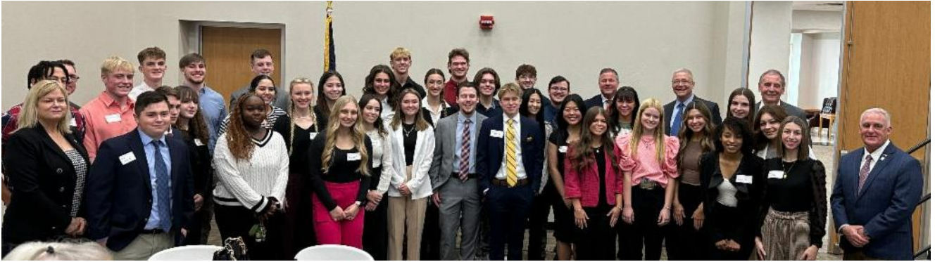
PCLC with our Legislators