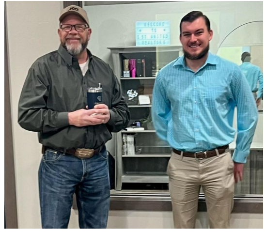
1st United OK Realtors - Ribbon Cutting & Coffee Connections