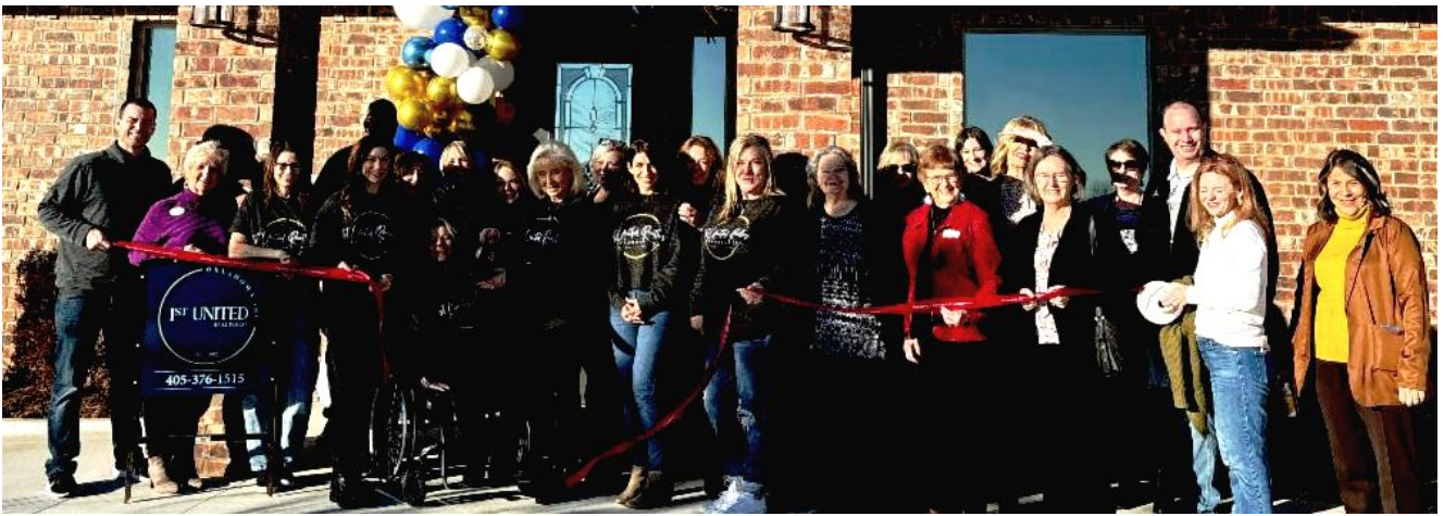
1st United OK Realtors - Ribbon Cutting & Coffee Connections