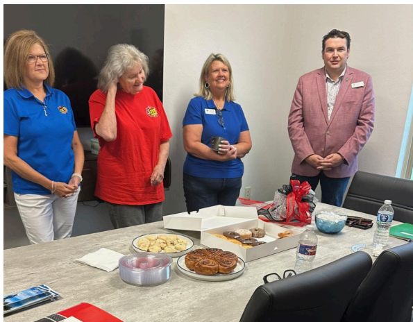
Panda Express & Primal Nerds Ribbon Cuttings